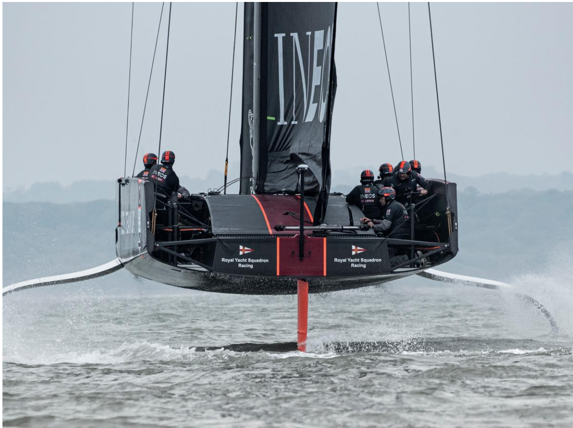
INEOS TEAM UK, skippered by Sir Ben Ainslie, training on their race yacht 'Britannia'

After 18 months of hard work and dedication inside the INEOS TEAM UK gym, better known as 'Fortitude', the 17-strong crew of sailors were able to test their fitness onboard their AC75 yacht 'Britannia' during her first sailing period.