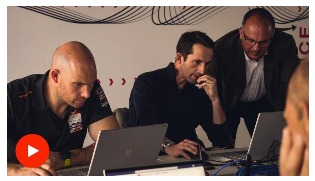
Watch Now | Inside Tech - The Software

Find out how we are utilising Siemens advanced technology to build and test Britannia.